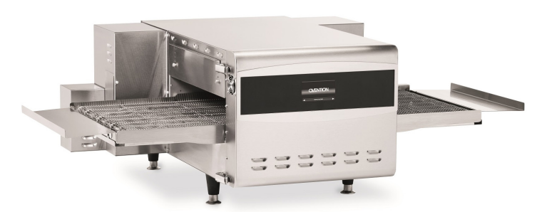
THE CONVEYOR C2000