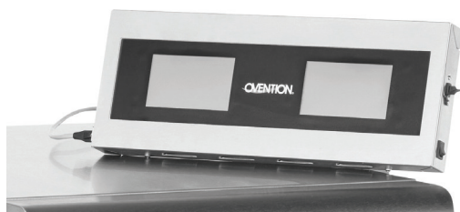
Optional remote mountable control module with 10ft cord

MORE AIR= BETTER QUALITY, FASTER Patented air flow technology means 3x more air than traditional impingement.