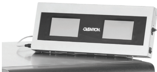
Optional remote mountable control module with 10ft cord

MORE AIR= BETTER QUALITY, FASTER Patented air flow technology means 3x more air than traditional impingement.