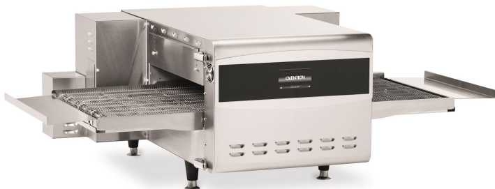
THE CONVEYOR C2000

† Ventless certification is for all food items except for foods classified as “fatty raw proteins”. Such foods include bone-in, skin-on chicken, raw hamburger meat, raw bacon, raw sausage, steaks, etc. If cooking these types of foods, consult local HVAC codes and authorities to ensure compliance with ventilation requirements. Ultimate ventless allowance is dependent upon AHJ approval, as some jurisdictions may not recognize the UL certification or application. If you have questions regarding ventless certifications or local codes, please email connect@ovationovens.com .