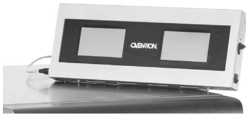
Optional remote mountable control module with 10ft cord

MORE AIR= BETTER QUALITY, FASTER Patented air flow technology means 3x more air than traditional impingement.