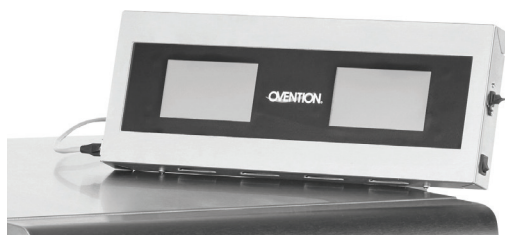
Optional remote mountable control module with 10ft cord

MORE AIR= BETTER QUALITY, FASTER Patented air flow technology means 3x more air than traditional impingement.